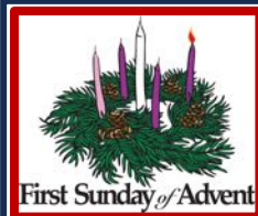
First Sunday of Advent